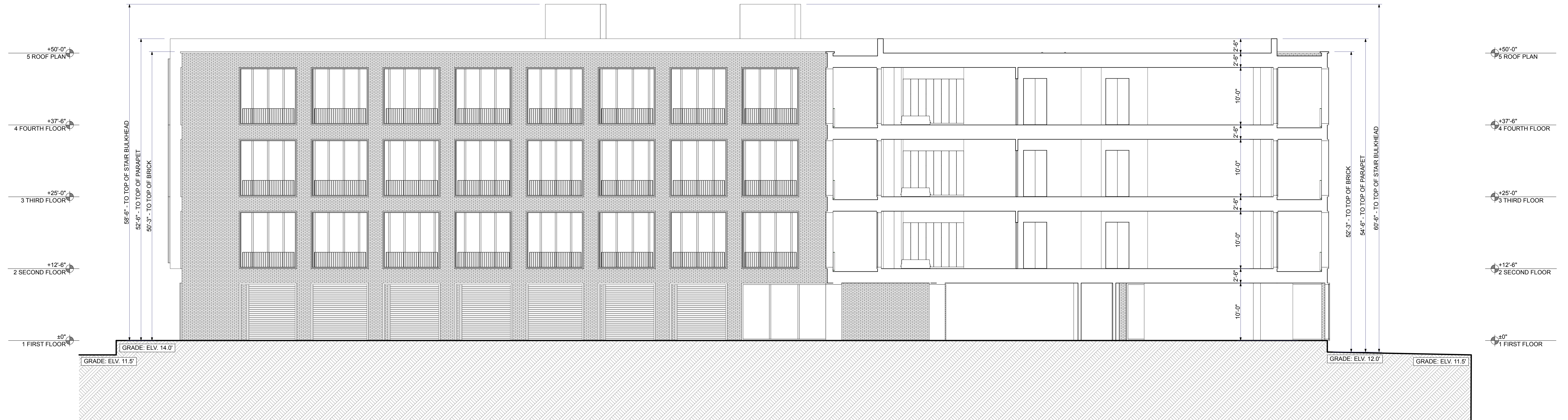
1 SECTION SCALE: 1/8" = 1'-0"