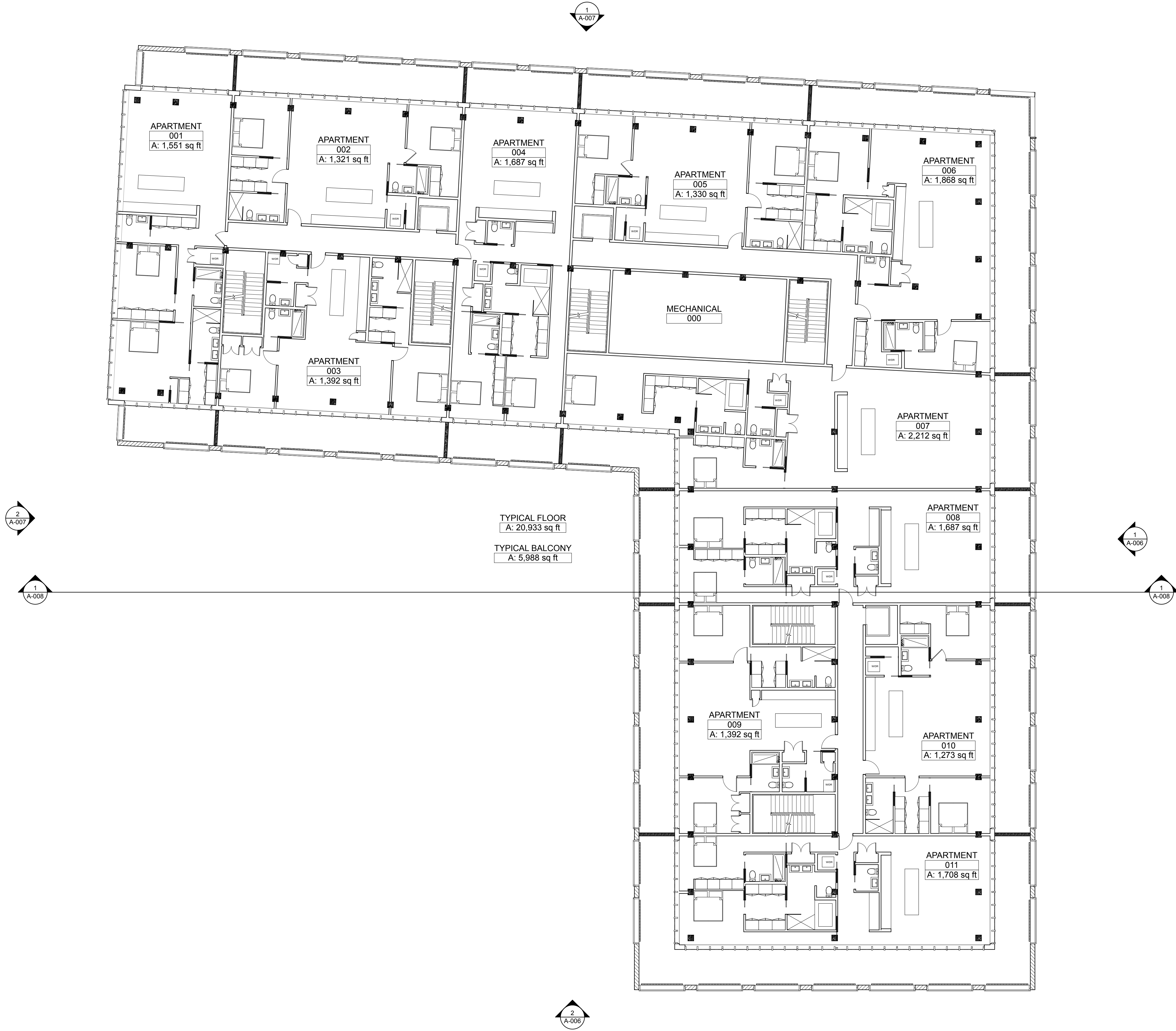
1 FOURTH FLOOR CONSTRUCTION PLAN SCALE: 3/32" = 1'-0"