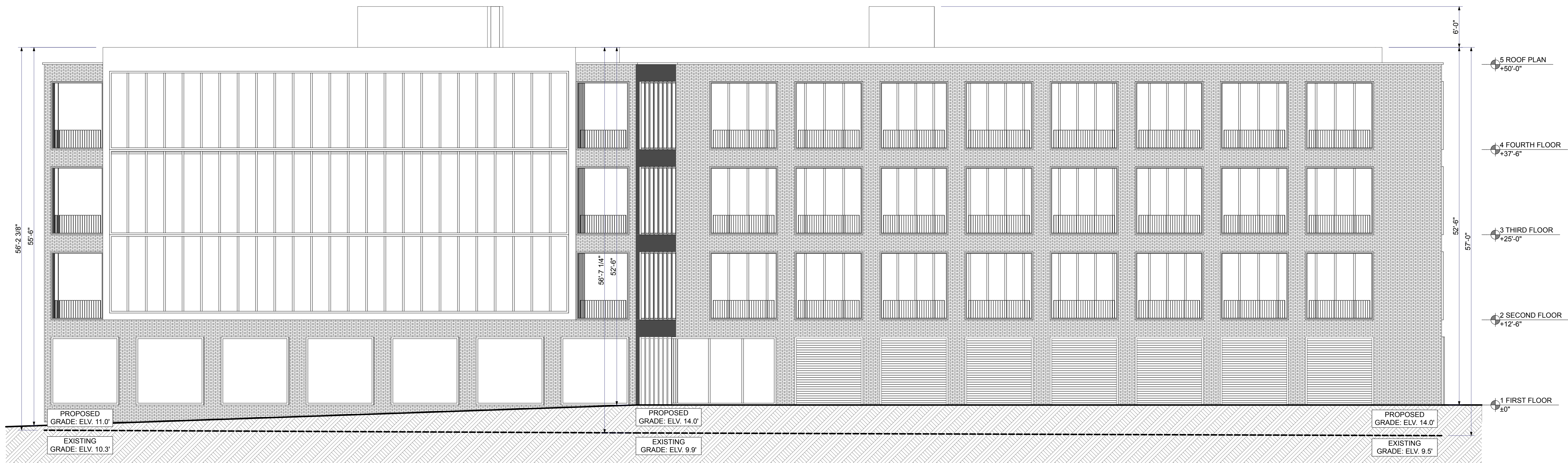
2 WEST ELEVATION SCALE: 1/8" = 1'-0"