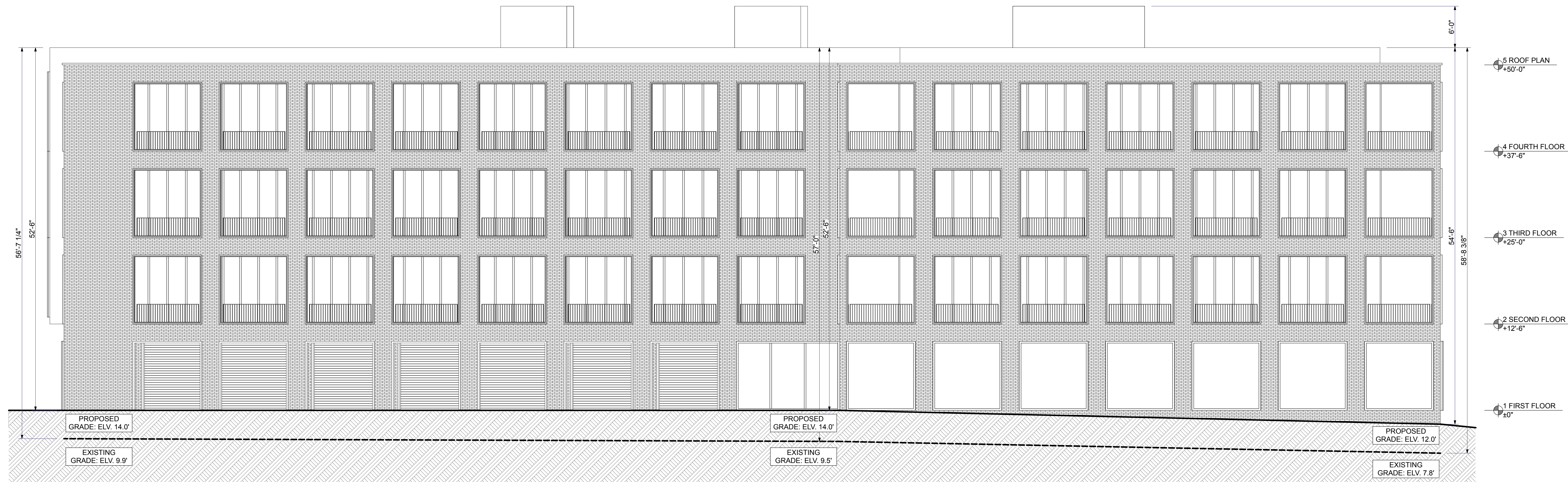
2 SOUTH ELEVATION SCALE: 1/8" = 1'-0"