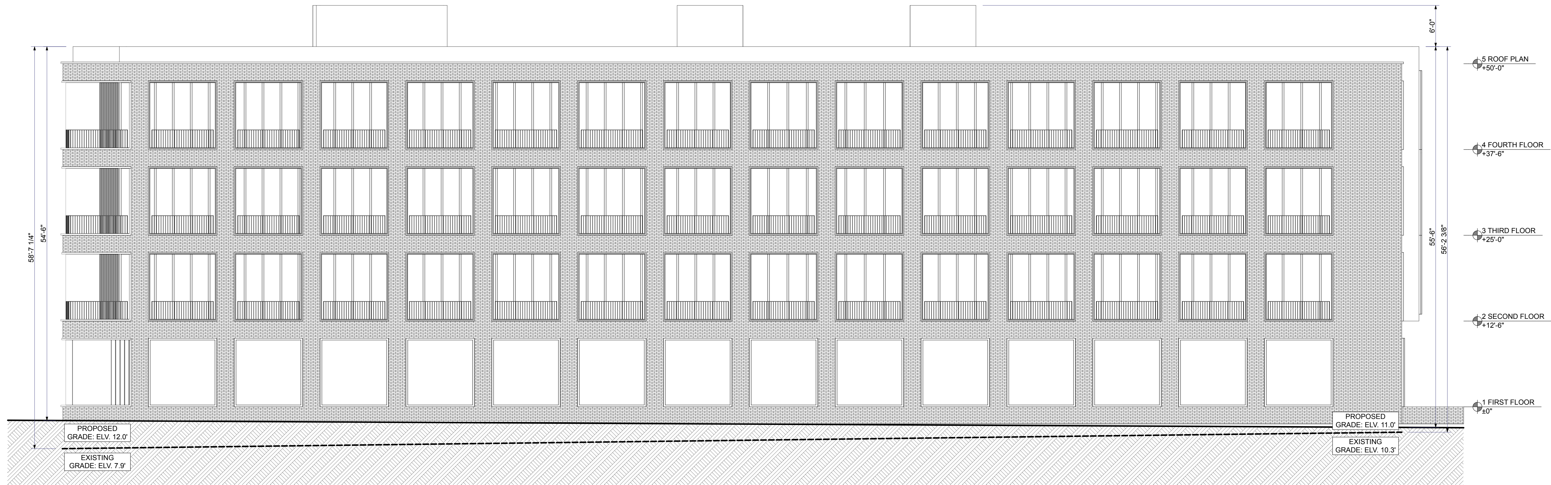
1 NORTH ELEVATION SCALE: 1/8" = 1'-0"